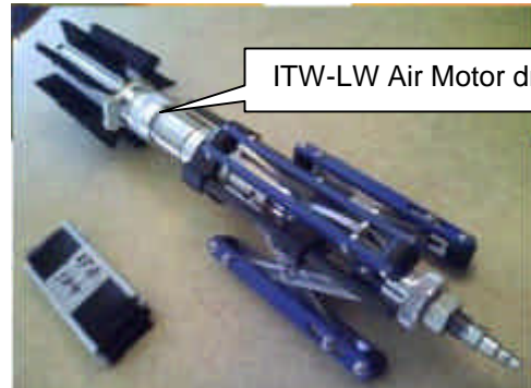
ITW-LW Air Motor drive